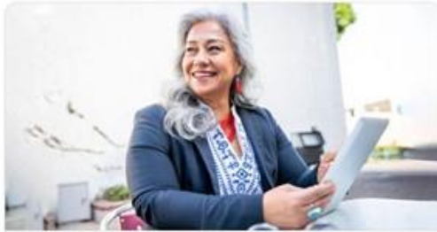
wisbar.org Accessible Content Broadens Your Client Base and Improves the Way You Work While lawyers are making strides in how they accommodate individual clients, our systemic practices can reveal gaps in knowledge about accessibility. Hamz...