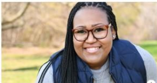
WISBAR.ORG Running on Empty? Wisconsin Lawyers On Being Mindful of Wellness

State Bar of Wisconsin Wellness is more than a spa treatment or that much-needed vacation. In recognition of Well-Being Week in Law week, here are some ways your colleagues make their health a priority. What do you do? #lawyerwellbeingweek #wislap #lawyerwellness #WellbeingWeekInLaw