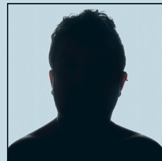
Vacant President- elect